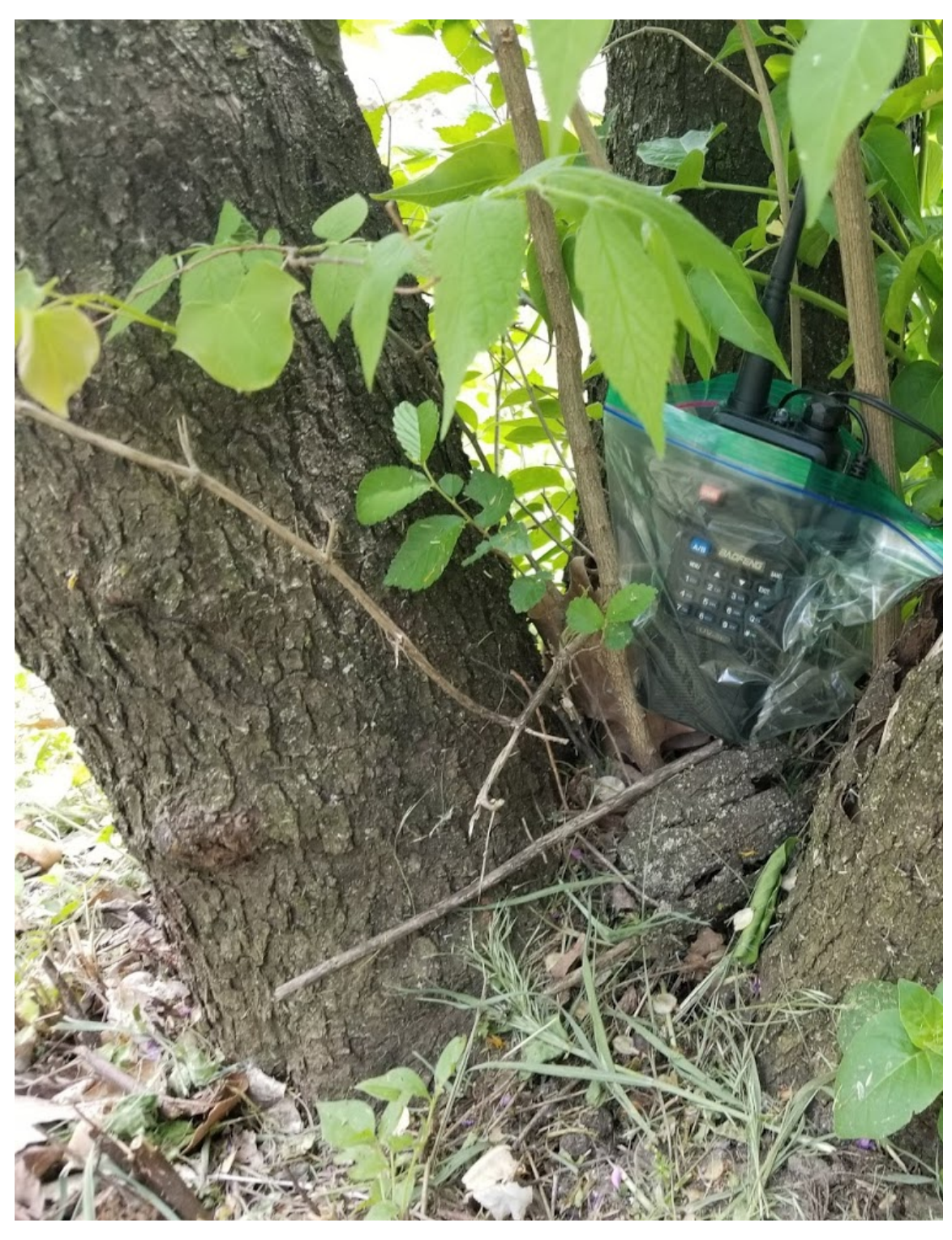
The second fox was hidden at Fairmont park in some bushes disguised as McDonalds trash.