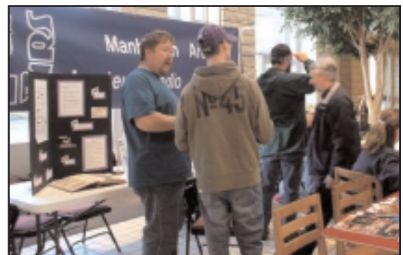
Visitors ask questions and discuss amateur radio

While we would have like to have had more people show more interest we did have several people stop by and talk on the radio as well as pick up information. Some ideas have risen for the June ARRL Kid's Day such as using the Manhattan Sunset Zoo for the location.